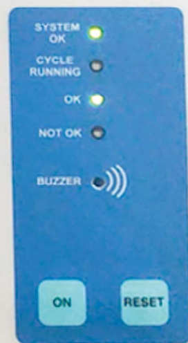
FPM-02 XY MONITOR